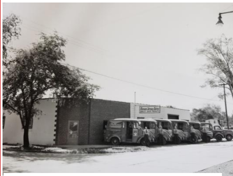
Parsons' Jersey Dairy