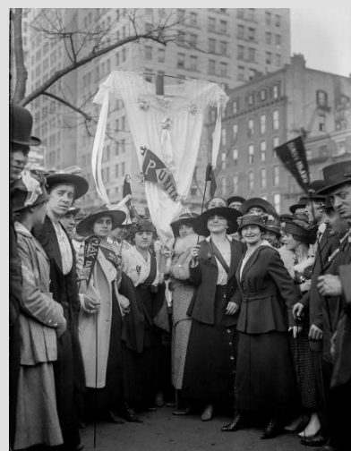
Photo: Women in an ILGWU affiliated union marching during the 1916 NYC May Day parade, courtesy The Library of Congress