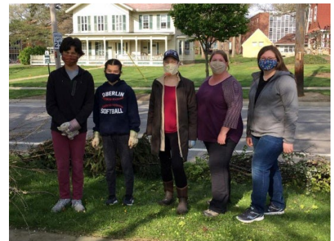
Photo: Helpers at the 2021 Grounds Day