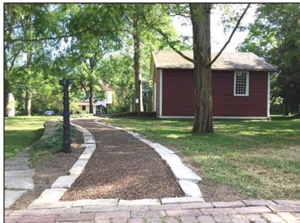
The Little Red Schoolhouse's pathway: before (upper left), during (upper right), and after restoration (below).