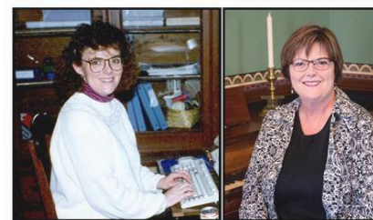
Then and now ... 25+ years at the Oberlin Heritage Center