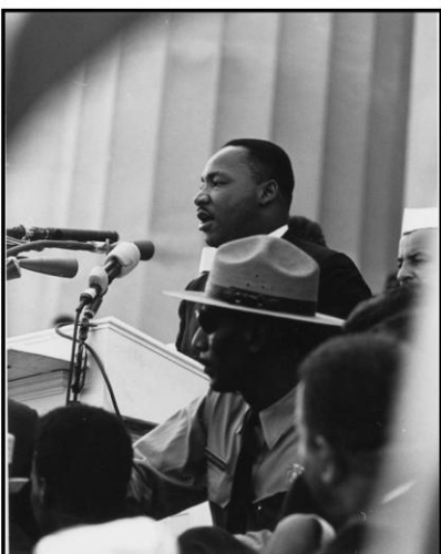
Join the community of Oberlin on October 14 in a celebration of the anniversary of Rev. Dr. Martin Luther King Jr. receiving the Nobel Peace Prize.

Thousands of books will be offered at The Friends of the Oberlin Public Library Fall 2018 Book Sale running from October 4 through 7 at the Oberlin Public Library (65 South Main Street). Proceeds from the sale benefit the Library's programs and services. For more information, including specific hours for each day, visit https://www.facebook.com/foopl/ and click on the "Events" tab.