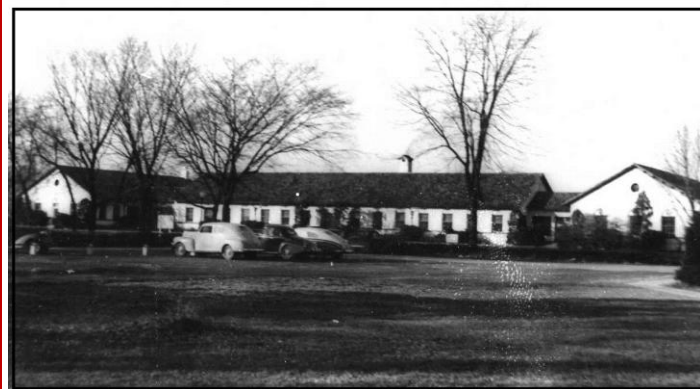
Allen Memorial Hospital, circa 1946.

Wednesday, April 5 from 6-8:30 p.m. (Social Hour begins at 5 p.m.)