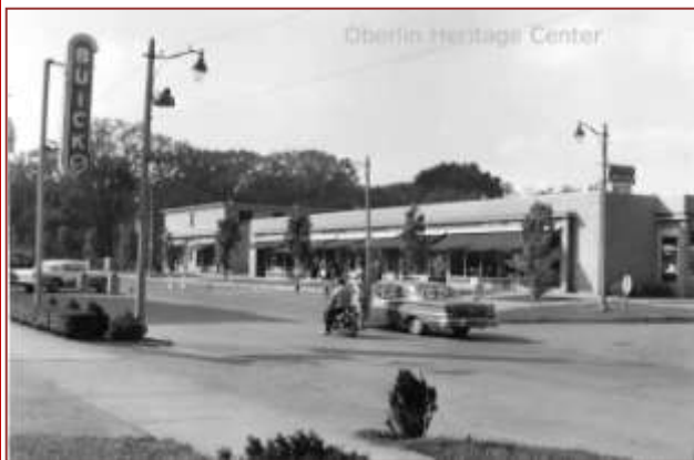
Photo of East College Street, just south of "old" Oberlin Inn, c. 1960.