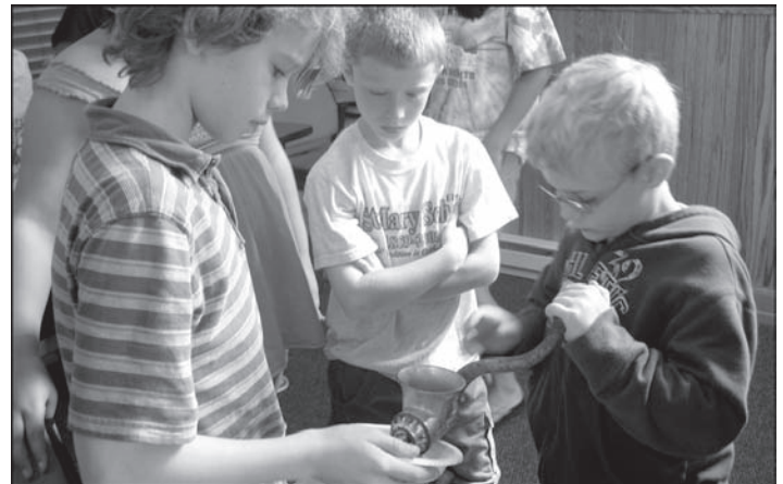
"Hungry for History" summer campers savored their lessons: Above , lads grapple with a historic food grinder; below , bowls compete for freshly churned chocolate ice cream.